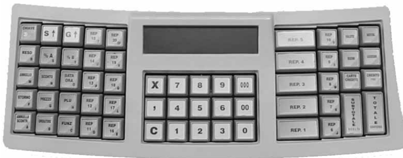
Photo of extended keyboard for ZIP and SMART models

ECR keyboard is constituted by keys which allow access to the sales, reading, resetting and programming functions. A special guide leads the user through the operations.